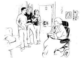
Caroling to Seniors and Shut-ins

Mark your calendar to join family and friends as Robeson Lutheran brings the sounds of Christmas to our sick and shut-ins on Sunday afternoon December 11 th . A light lunch will be provided in Hoeffler Hall following the 10:15 service and congregational meeting so that those wishing to carol will not have to run home and back again. We hope to leave the church by 12:30 to carol in order to be back at the church by 3:30. The more people we have the more groups we can form and our caroling will be meaningful and unhurried for our shut-ins. This event is for all ages, families are encouraged to go as a group. It is hoped that we can have enough people to make three groups of at least ten people per group. There will be sign-up sheets in the old and new foyer. Please list your name and also if you would be willing to be a driver for this event and if you will be staying for lunch. WE NEED MANY VOICES, YOUNG AND NOT SO YOUNG, AND IF YOU CAN PLAY A GUITAR OR OTHER MUSICAL INSTRUMENT TO ACCOMPANY US THAT WOULD MAKE THIS A SPECIAL VISIT FOR OUR INFIRMED MEMBERS.